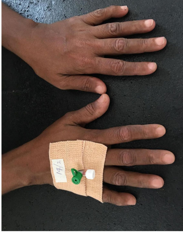
Fig. 3 Resolution of mechanic's hands after IV cyclophosphamide