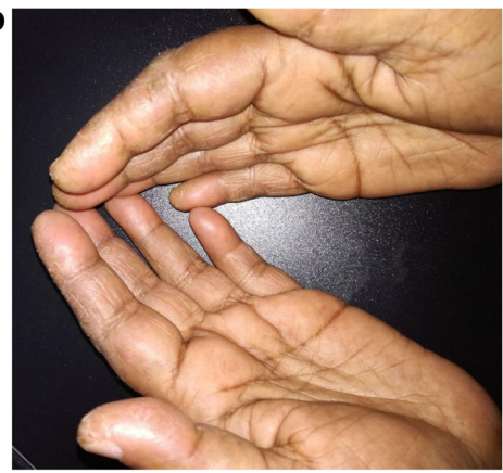
Fig. 2 a Fissuring and cracking of hands suggestive of mechanic's hands at the onset of disease relapse. b Fissuring and cracking of hands suggestive of mechanic's hands at the onset of disease relapse