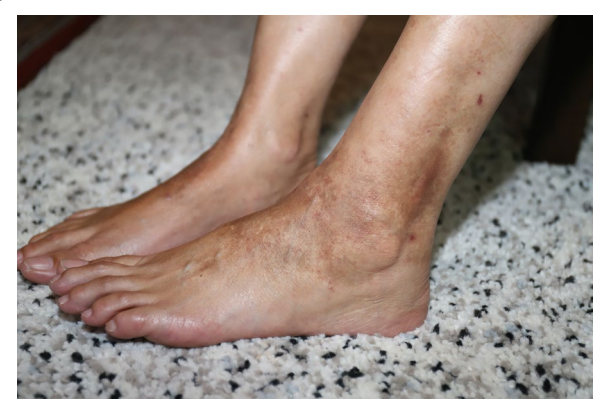
Fig. 2 Purpuric dermatoses on patient's lower limbs

Adalimumab was started. Both agents controlled her peripheral disease. The neutropenia resolved on Golimumab however the rash continued to worsen and progress up to her lower abdomen.